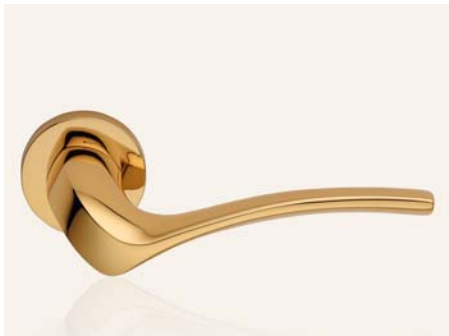
OZ oro zecchino gold plated