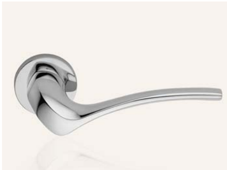
CR cromo lucido polished chrome