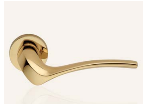
OL ottone lucido verniciato polished brass