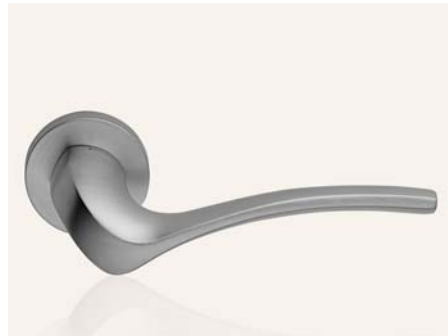
CS cromo satinato satin chrome