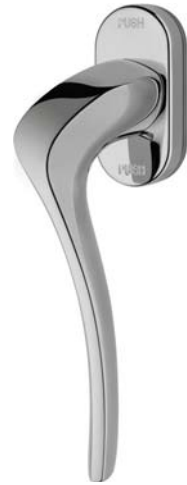
COD. 691 SK