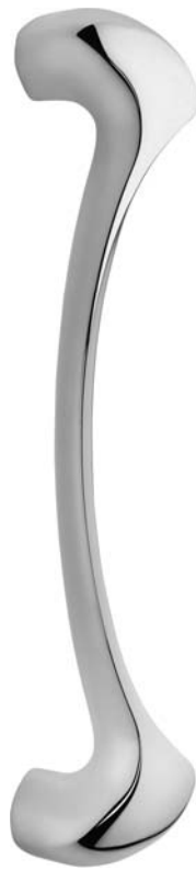
COD. 691 MN 300