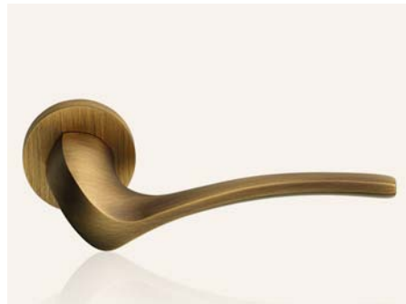
PM patiné patiné mat