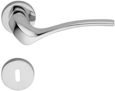
COD. 691 RB 023