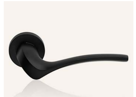
VE nero opaco matt black