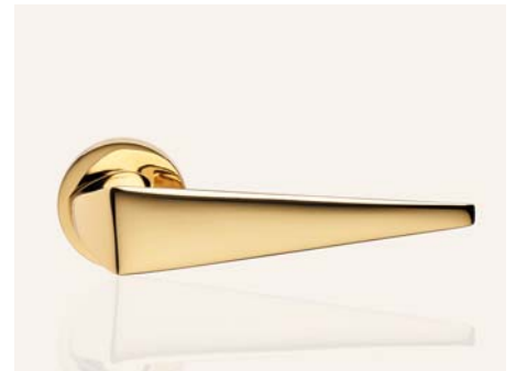
OZ oro zecchino gold plated