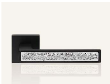
CE nero opaco + cromo matt black + polished chrome mix