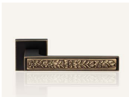
NP patiné + bronzo opaco patiné matt + matt bronze