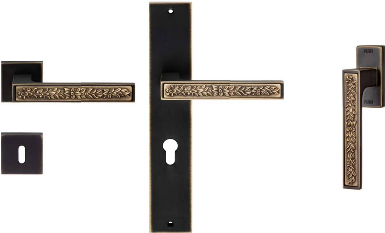
COD. 1585 RB 019