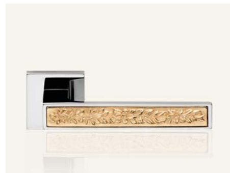
CZ oro + cromo gold + chrome