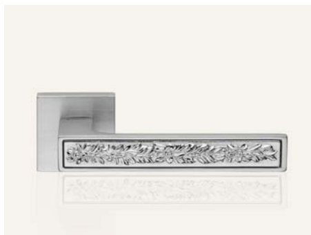
CC cromo satinato + cromo satin chrome + polished chrome mix